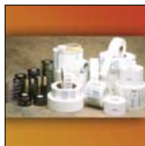
Suitable for Tag & Label Printing