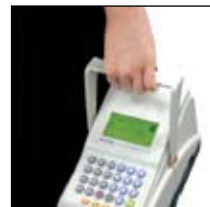
Portable / Stand-Alone