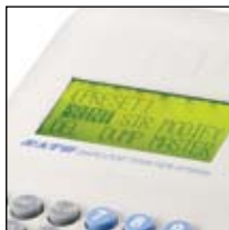
Large LCD Panel