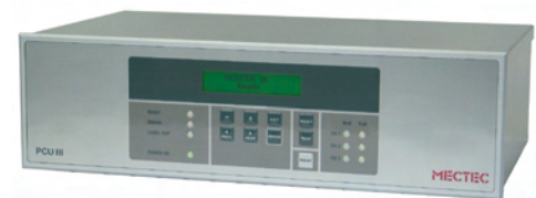
Printer Control Unit PCU III (Please note: ACC not included)