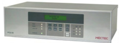
Printer Control Unit PCU III