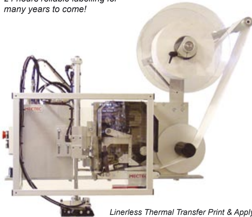
Linerless Thermal Transfer Print & Apply unit - including protective cover and emergency stop

The Linerless printer has the reliable, robust and easy to use design - as seen on all the Mectec family machines. It is proven to give you 24 hours reliable labelling for many years to come!