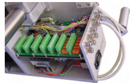
Controller and I/O:s easy accessible