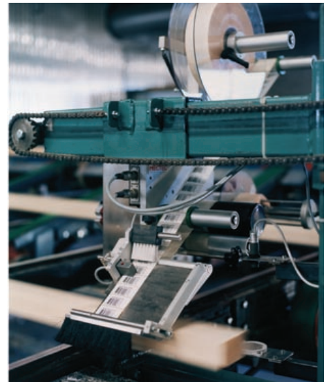
Labelling within wood industry - a rough environment that puts high demands on the equipment.