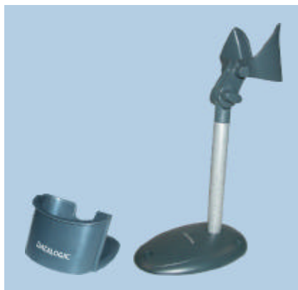
SPC Heron™ G and STD Heron™ G