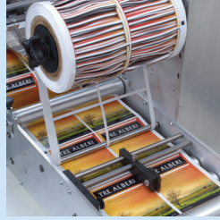
Removal of waste matrix