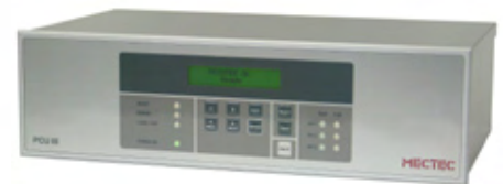
Printer Control Unit PCU III