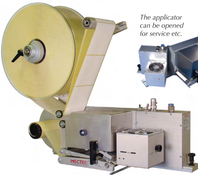
Printer and applicator in left hand version